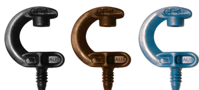
Cfd™ Downspray Range