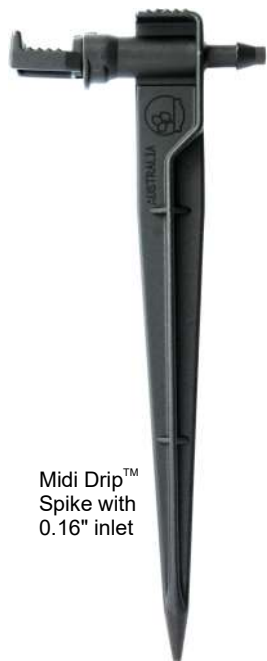
Midi Drip™ Spike with 0.16" inlet