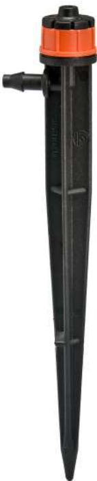
Shrubbler® 360° PC Spike with 0.16" Inlet