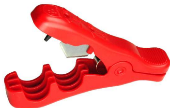
2 in 1 Punch & Cutter