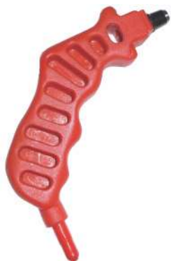
Hole Punch 7.5 mm (for LDPE Take-Off Fittings)