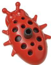
DripPets™ Ladybug PC 1 gph Barb 0.16"