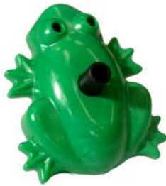
DripPets™ Frog PC 1 gph Barb 0.16"