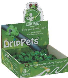
DripPets™ Frog Retail Box