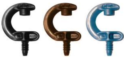
Cfd™ Downspray Range