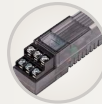
A2M-600 6-station expansion module with advanced surge suppression