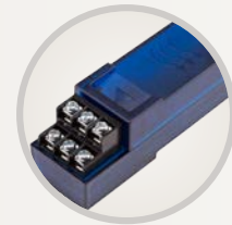
A2C-F3 3 input flow meter expansion module