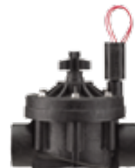
ICV-151G Inlet Diameter: 1½" Height: 7½" Length: 6¾" Width: 5½"