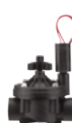
ICV-101G Inlet Diameter: 1" Height: 5½" Length: 4¾" Width: 4"