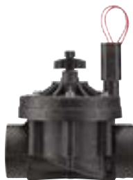
ICV-201G Inlet Diameter: 2" Height: 7½" Length: 6¾" Width: 5½"