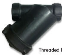
Threaded End Cap