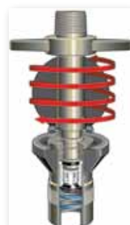
Acme® threads provide convenient flow control

Signature quick coupling valves and keys use Acme® threads for slow and steady flow control instead of immediate on/off. All models feature rubber cover. Optional locking cover available. Optional lavender rubber cover identifies reclaimed water site – molded in "RECLAIMED WATER - DO NOT DRINK": in English and Spanish.