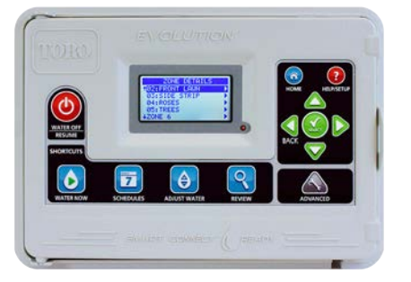
PSS-SEN Model Can be used with the EVOLUTION° Controller with intergraded Smart Connect°