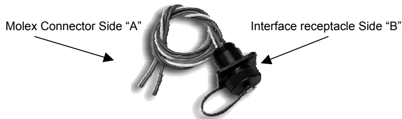
DCI-1-H cable Part Number: 01386