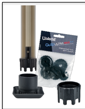
Gulp™ PRO Replacement Parts

Thoroughly wash the inside of the hand pump cylinder, then wash both loosened ends. Replacement parts for the current are available, see Figure 2-2 below;