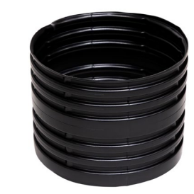
• DFLXCOUPL: Flexible Drainage Pipe Coupler