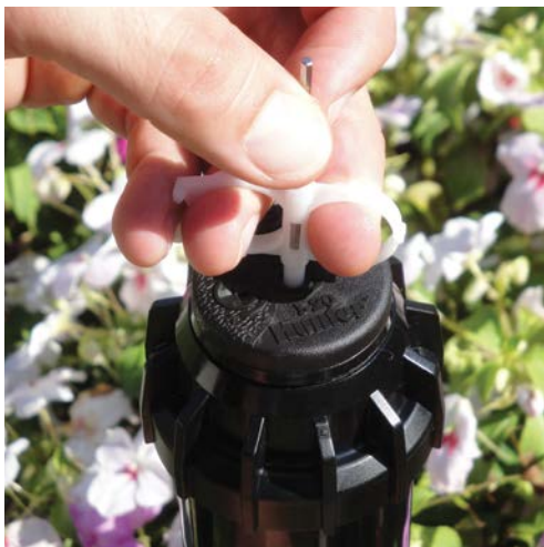
I-20 can be turned off at the head if needed

I-20-12 Overall Height: 17" Pop-up Height: 12" Exposed Diameter: 1¾" Inlet Size: ¾" female NPT