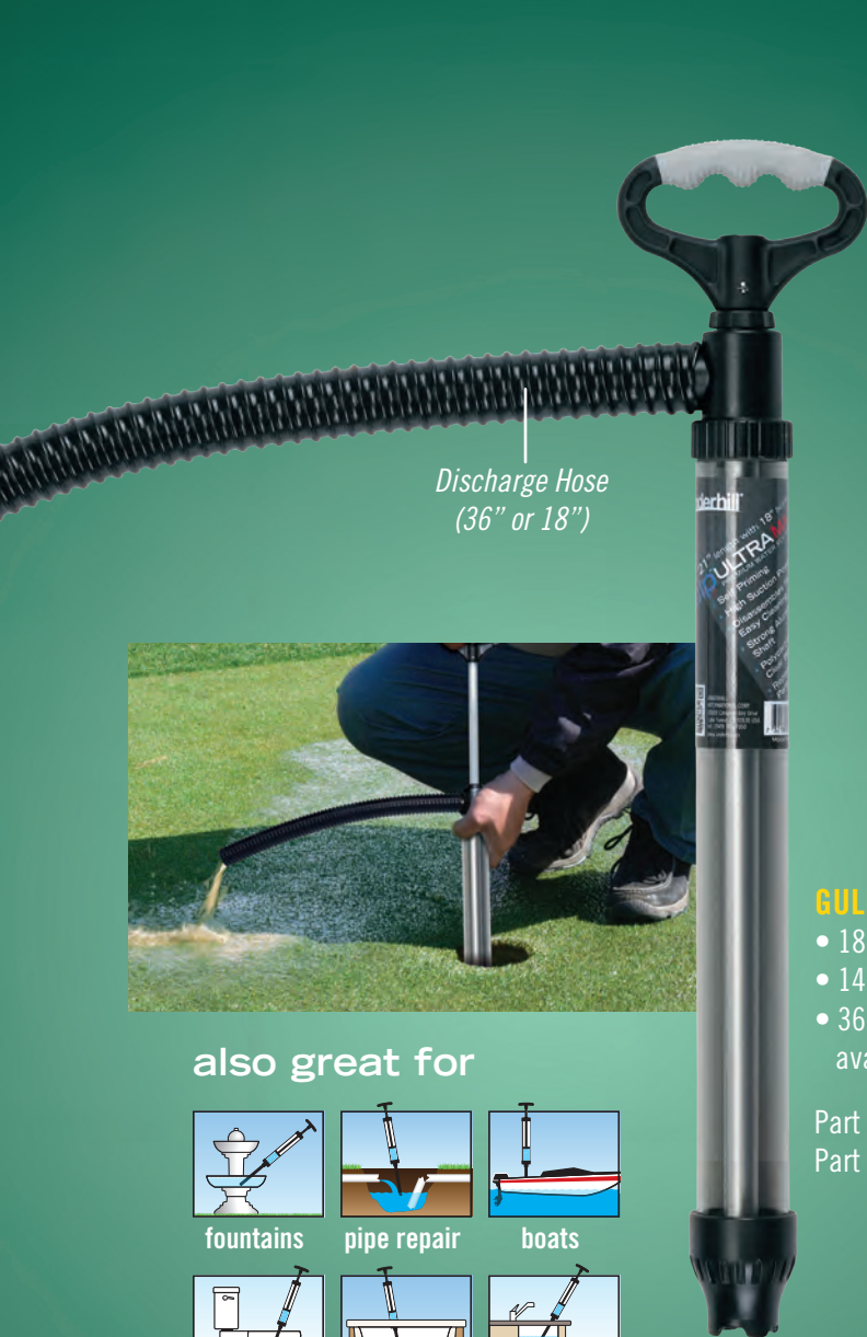
Discharge Hose (36" or 18")