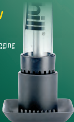
Included with 36" Big Gulp